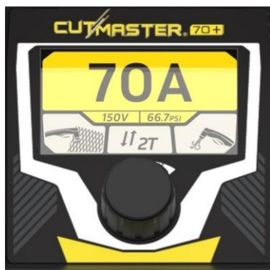
Simple and intuitive TFT LCD panel