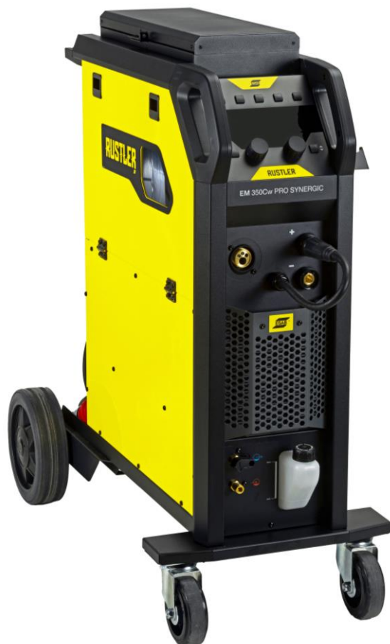
Rustler EM 350Cw PRO Synergic

Rustler MIG PRO compact welding inverters are your solution of choice for the most common welding challenges. Equipped with the latest inverter technology, they combine low energy consumption with optimized welding performance.