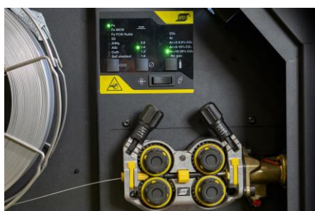
Best in class wire feeding mechanism