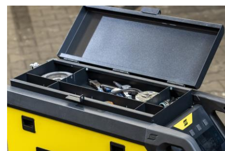
Optional top toolbox for accessories