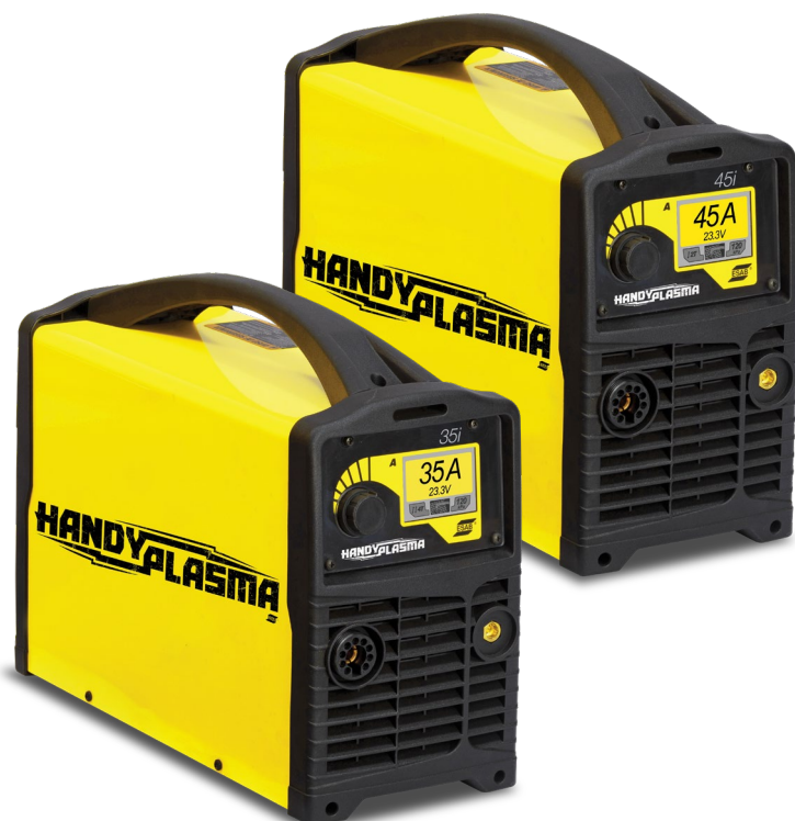
HandyPlasma 35i / 45i

Hand-held, light and portable power source for plasma cutting with a 220/ 230V 50/60Hz single phase power supply.